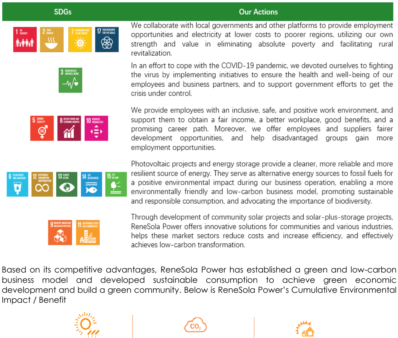
4.4 BILLION Kilowatt hours of clean energy produced since 2014

The UN SDGs describe a much anticipated bright future that can only be realized by the joint efforts of humankind. As a leading green energy enterprise, ReneSola Power leverages its global presence and solid experience in the industry to have a positive impact on the environment and execute the SDGs.